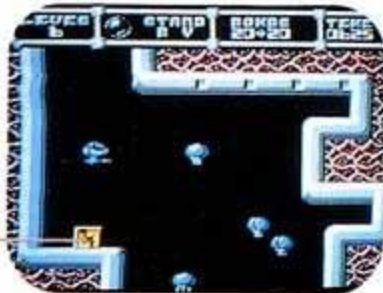
A.C.M.E. PACKING CASE

NOTE: FINDING ADDITIONAL WEAPONS — Except for the laser blaster, your supply of the above weaponry will be limited. But there are more weapons scattered over the asteroids. They can be found in A.C.M.E. packing cases occasionally dropped by the Zoggians. And the more enemies you destroy, the more weapons will become available.